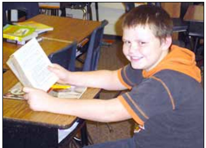
Reading time is a happy time!