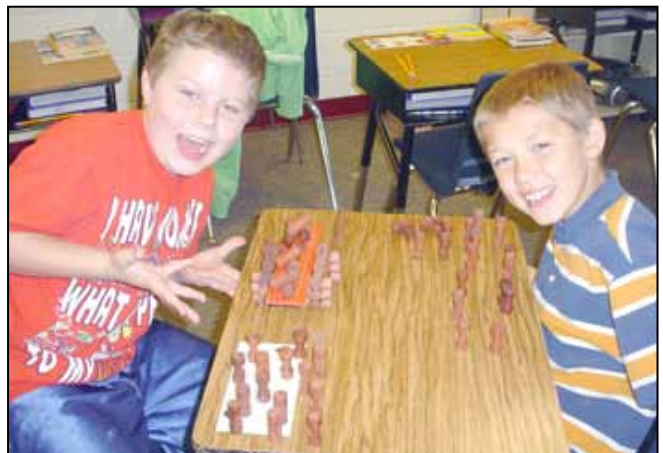
Students find a new way to play with Lincoln Logs during indoor rainy day recess

Elem 8:05 a.m. - 12:00 p.m. MS/HS 8:00 a.m. - 11:45 a.m.