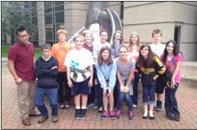
Seventh grade students traveled to Traverse City for a performance at Denmos Museum and a tour of Northwestern Michigan College.