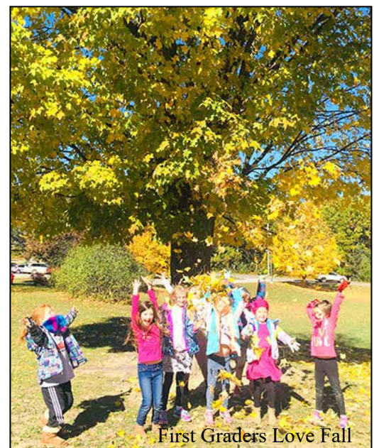
First Graders Love Fall