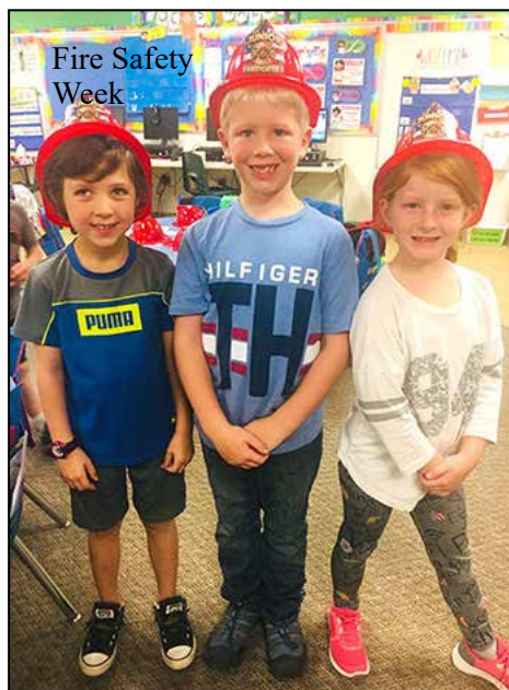
Fire Safety Week