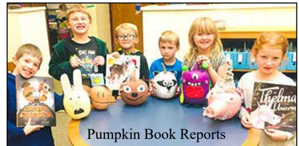
Pumpkin Book Reports